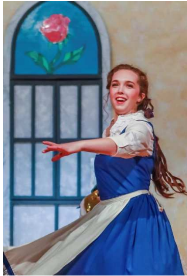
The Greer Children's Theatre performed Disney's Beauty and the Beast November 8-10 and 15-17.