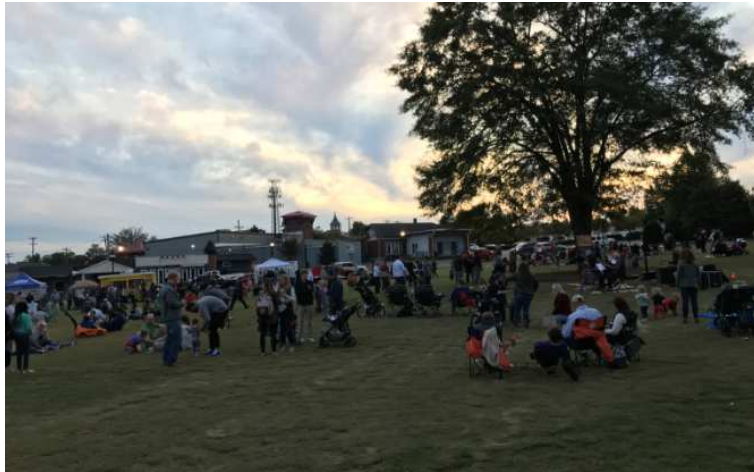
The final Food Truck Rollout of the year was held on October 18 in City Park.

"Creating Community through People, Parks and Programs"