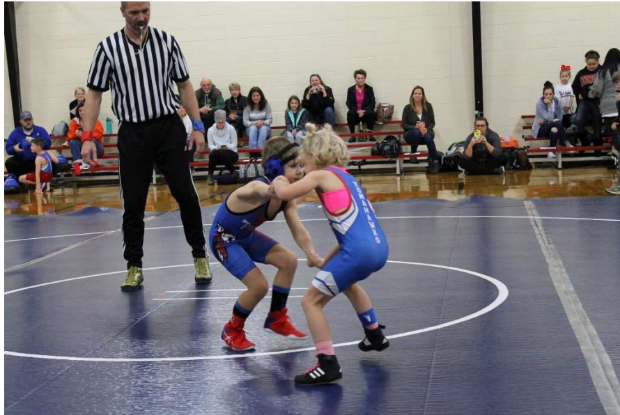
Tomahawk Youth Wrestling practices were held at Riverside High School on Tuesday and Thursday nights throughout the month of January.

"Creating Community through People, Parks and Programs"