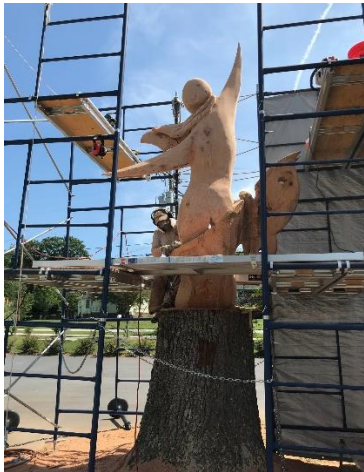
Center for the Arts Living Sculpture

"Creating Community through People, Parks and Programs"