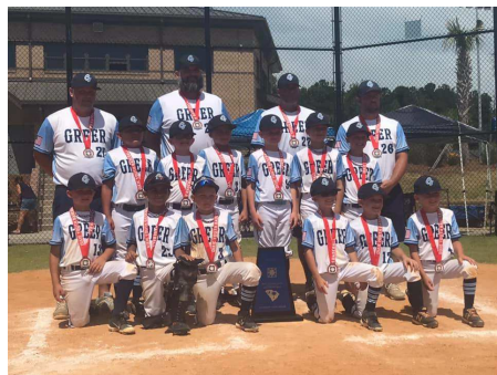
8U All-Star Team