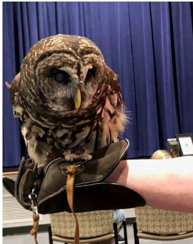
Tall Tale Tuesdays

"Creating Community Through People, Parks, & Programs"