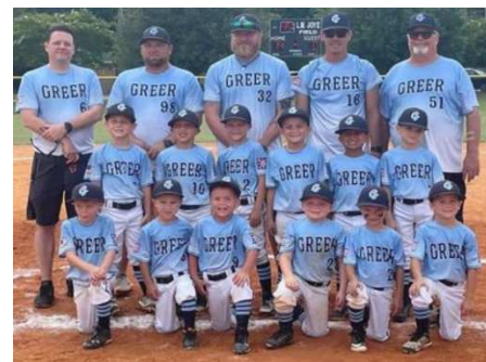
6U All-Star Team