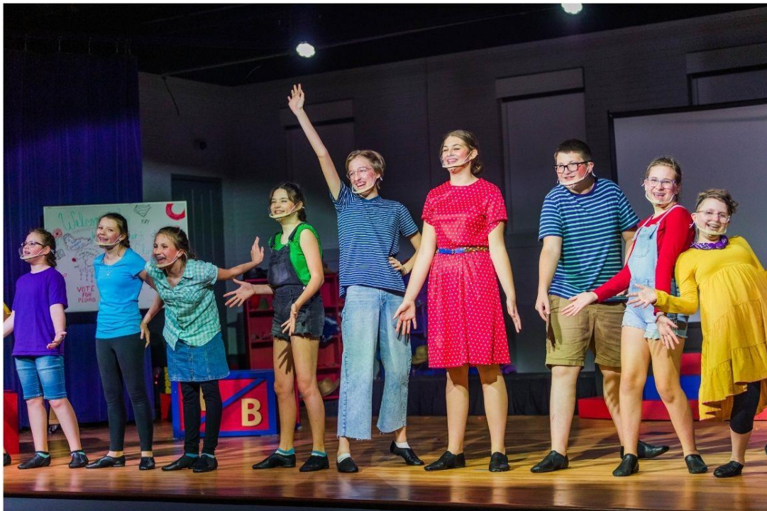
Greer Children's Theater School House of Rock Live! Jr.

"Creating Community Through People, Parks, & Programs"