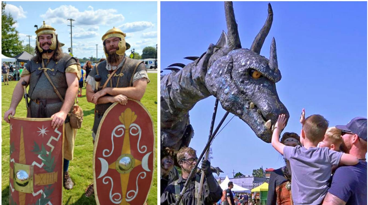
Upstate Renaissance Faire & Medieval Market

"Creating Community Through People, Parks, & Programs"