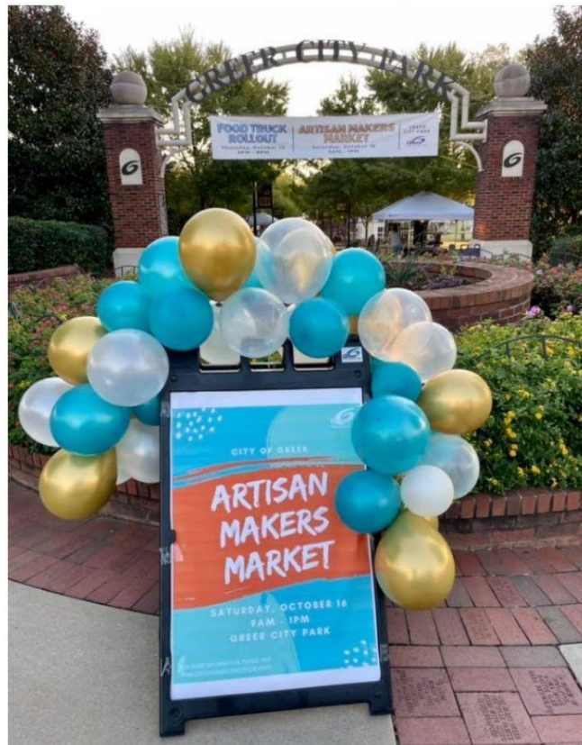
Artisan Makers Market

"Creating Community Through People, Parks, & Programs"