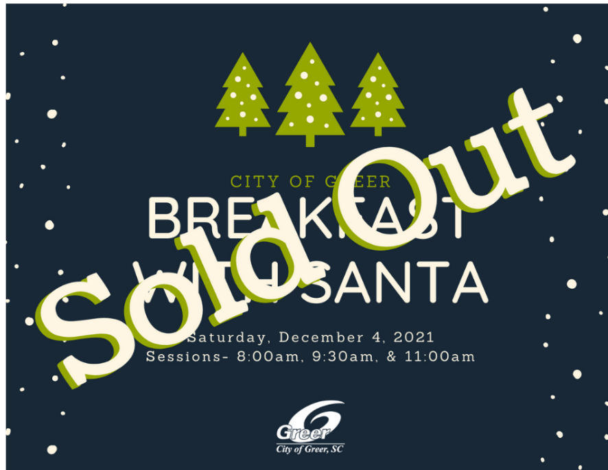
Breakfast with Santa

"Creating Community Through People, Parks, & Programs"