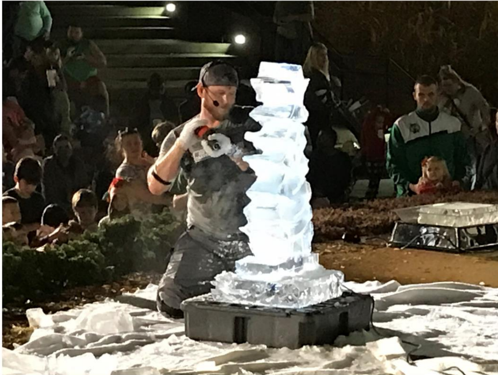
Ice Carving at the Christmas Tree Lighting

"Creating Community Through People, Parks, & Programs"